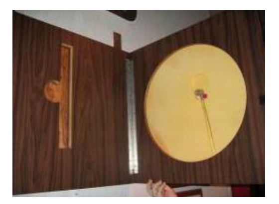
Fig. (1): The Buran eavesdropping system made by Léon Theremin [1]

The technique of using a light beam to remotely record sound was probably originated by Léon Theremin in the Soviet Union at or before 1947, when he developed and used the Buran eavesdropping system. This is done by using a low power infrared beam (not a laser) from a distance to detect the sound vibrations in the glass windows as shown in fig. (1) [1].