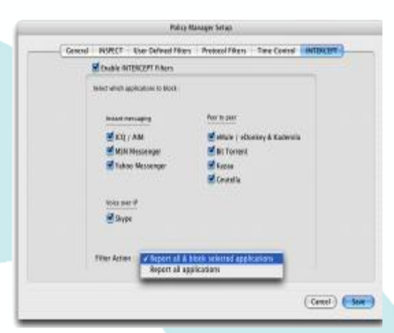
InterGate Intercept Filters

Skype is a proprietary peer-to-peer [P2P] voice over Internet protocol [VoIP] that intentionally evades network policies and may expose enterprises to security and liability risks. Its network is defined by all users of the free desktop software application. Skype users can speak to other Skype users, call traditional telephone numbers, receive calls from traditional phones, and receive voicemail messages. In addition, Skype allows its users to send instant messages and transfer files to other users in the Skype network. Because it was designed to work in overly restrictive environments, it is difficult to control via traditional means, such as firewalls.